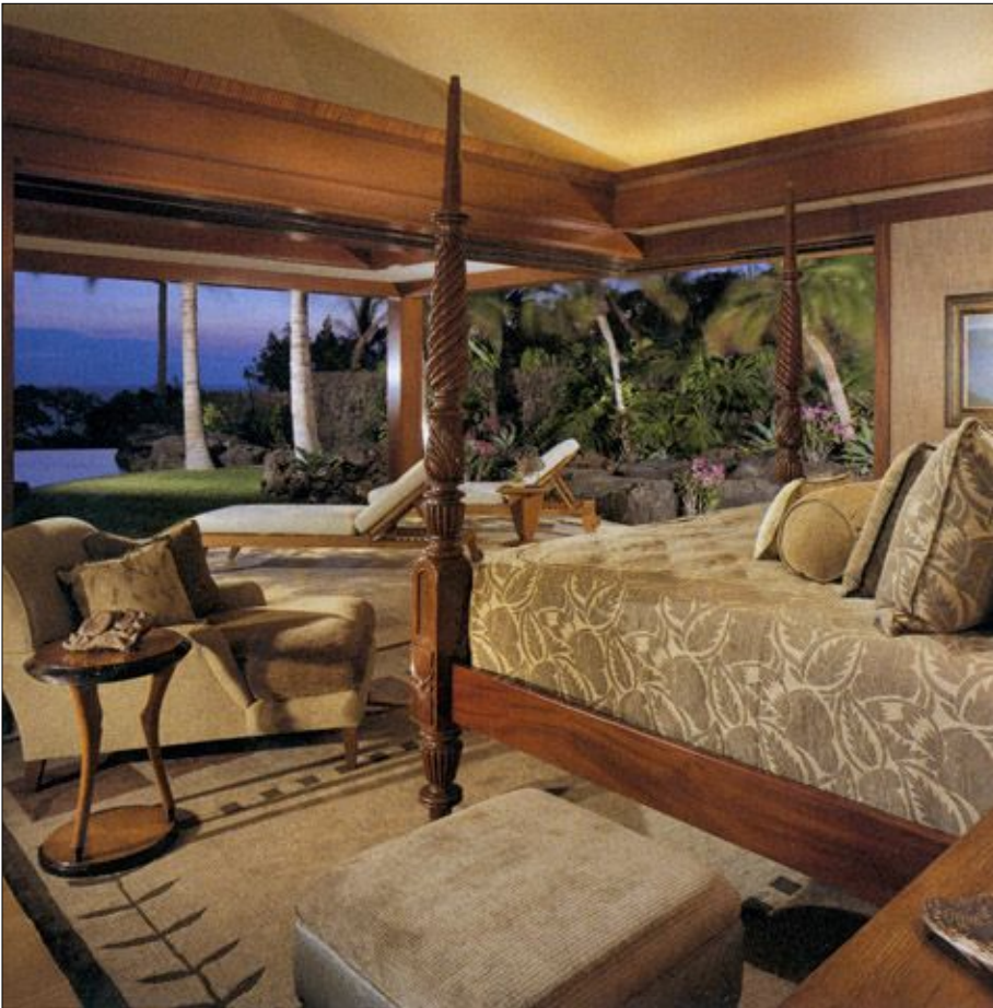
ABOVE: The dramatic master bedroom opens on three sides, revealing gardens and an unobstructed ocean view. “The palette is soft and toward green to accentuate the interplay with the landscape.” Lanai furniture, Michael Taylor. Pollack chenille on chaise. Edelman leather on ottoman.