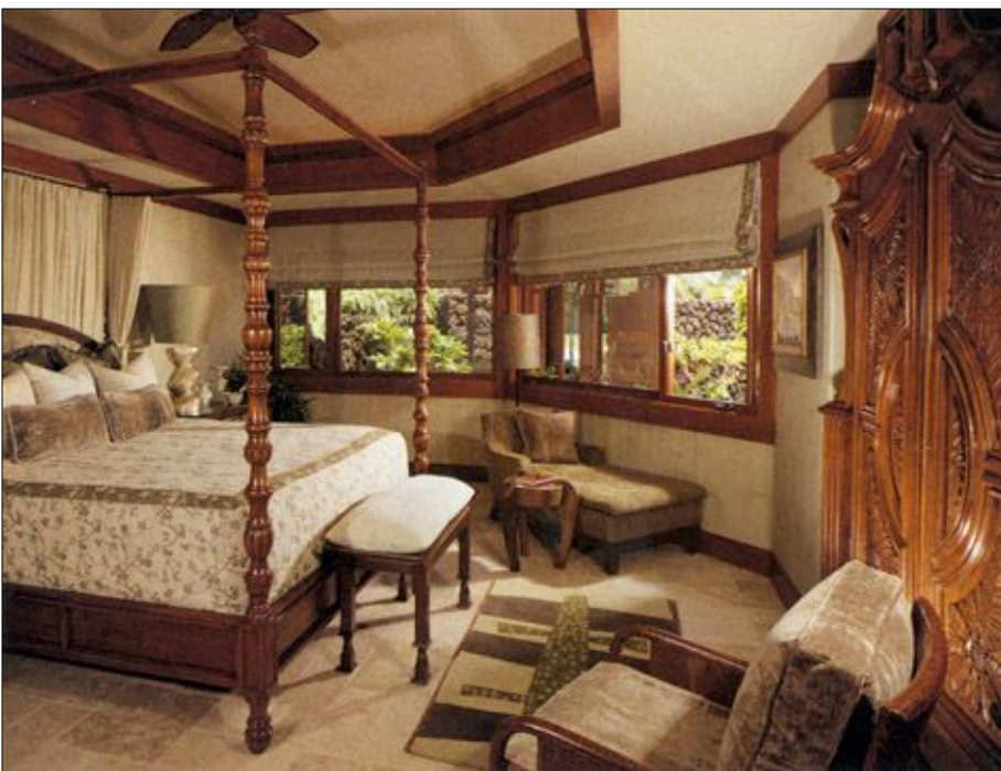
BELOW: An Italian armoire carved with ferns takes a guest room “into an almost believable Hawaiiiana.” Phillip Jeffries bedcovering fabric shade trim and rear pillow fabric. Chair fabric and all other pillow fabrics, Larsen. Pindler & Pindler fabric on lampshade at right.

sized lot that before the owner bought it, he needed Huddleson’s reassurance that it could accommodate a house and guesthouse—five bedrooms and six baths altogether. Huddleson came up with the footprint in a day but then took a year to plan and refine the structures. Illusion figured too: “I used the longest diagonal possible to pull your eye across the lengths of the water to the sea.”